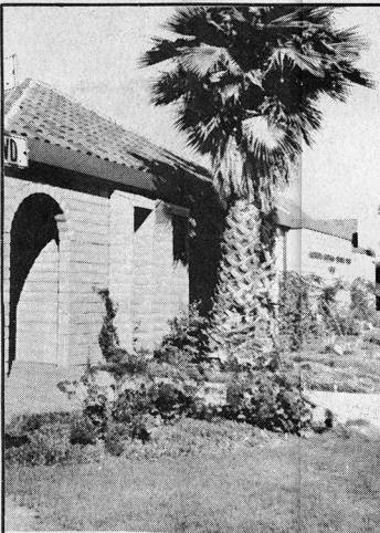
Murietta Medical Center, one of many local building developments handled by Livermore Properties, Inc. houses many medical and dental offices near Valley Memorial Hospital. Murietta Medical Center is located at Fenton and Murietta Blvd. Another Livermore Properties development is Valley Medical Center at 1205 East Stanley Blvd.

If you haven't seen La Castilleja yet, see it today. And welcome to a new concept in community living.