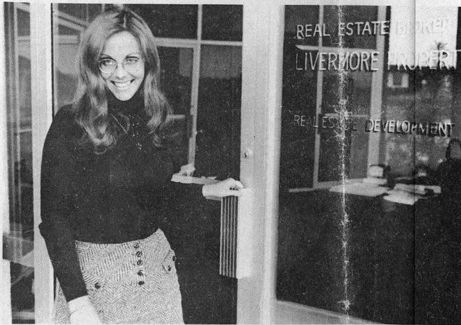
Livermore Properties, Inc., 999 East Stanley Blvd. welcomes residents to their lawn party at La Castilleja Phase 88 held at poolside (975